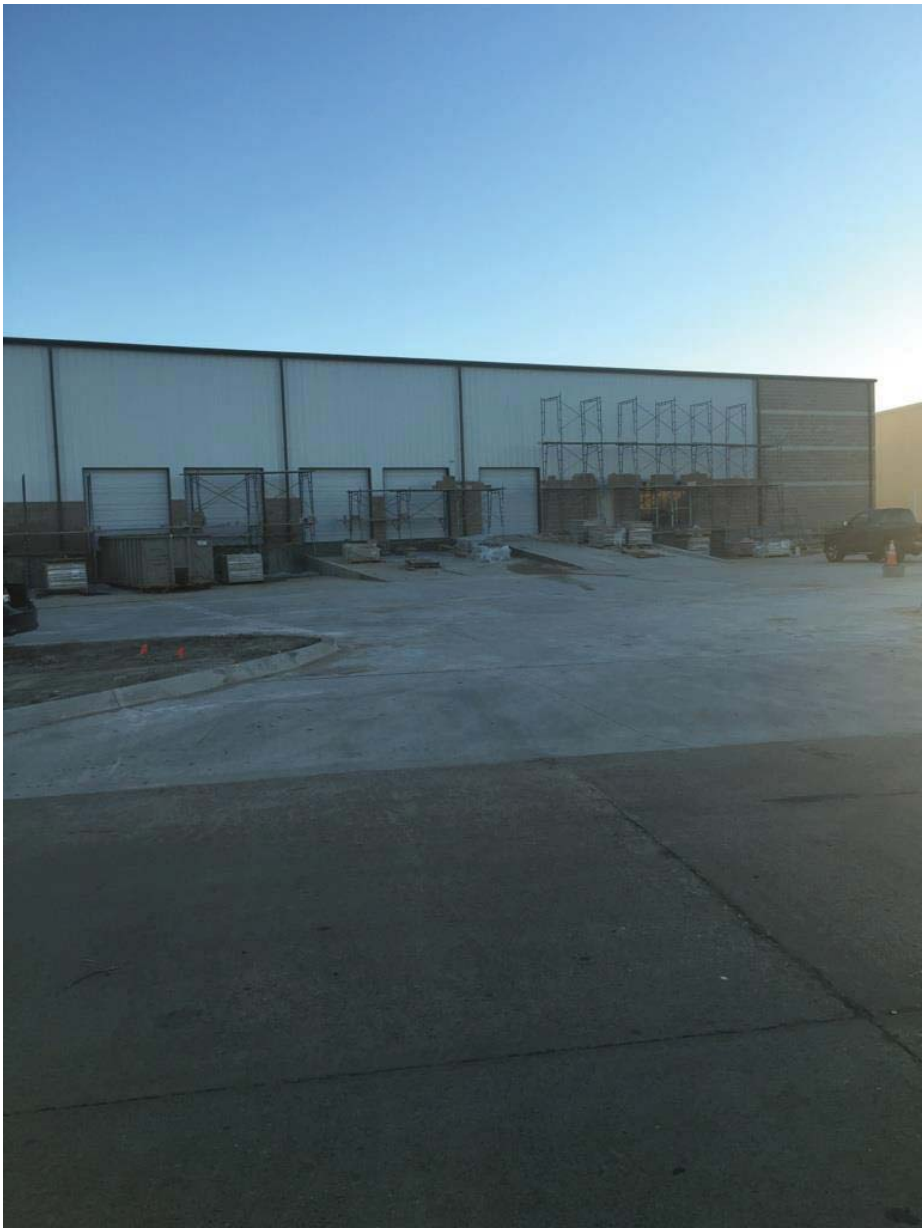
Northwest Corner of Building Looking Southwest

If submitting more photographs than will fit on the preceding page, affix the additional photographs below. Identify all photographs with: date taken; "Front View" and "Rear View"; and, if required, "Right Side View" and "Left Side View." When applicable, photographs must show the foundation with representative examples of the flood openings or vents, as indicated in Section A8.