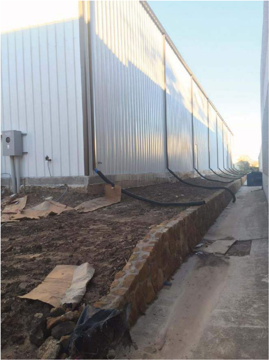
Southwest Corner of the Building Looking East

If using the Elevation Certificate to obtain NFIP flood insurance, affix at least 2 building photographs below according to the instructions for Item A6. Identify all photographs with date taken; "Front View" and "Rear View"; and, if required, "Right Side View" and "Left Side View." When applicable, photographs must show the foundation with representative examples of the flood openings or vents, as indicated in Section A8. If submitting more photographs than will fit on this page, use the Continuation Page.