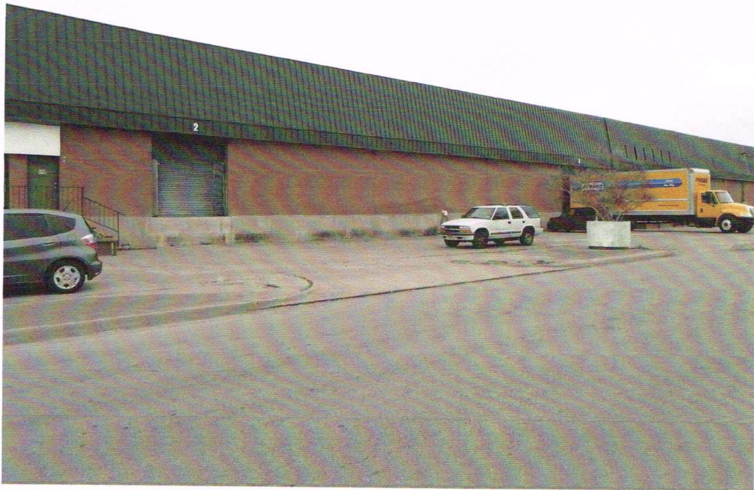
FRONT VIEW 2-1-2016

If using the Elevation Certificate to obtain NFIP flood insurance, affix at least 2 building photographs below according to the instructions for Item A6. Identify all photographs with date taken; "Front View" and "Rear View"; and, if required, "Right Side View" and "Left Side View." When applicable, photographs must show the foundation with representative examples of the flood openings or vents, as indicated in Section A8. If submitting more photographs than will fit on this page, use the Continuation Page.