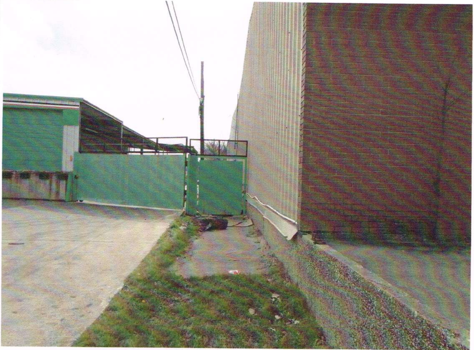
REAR VIEW 2-1-2016

If submitting more photographs than will fit on the preceding page, affix the additional photographs below. Identify all photographs with: date taken; "Front View" and "Rear View"; and, if required, "Right Side View" and "Left Side View." When applicable, photographs must show the foundation with representative examples of the flood openings or vents, as indicated in Section A8.